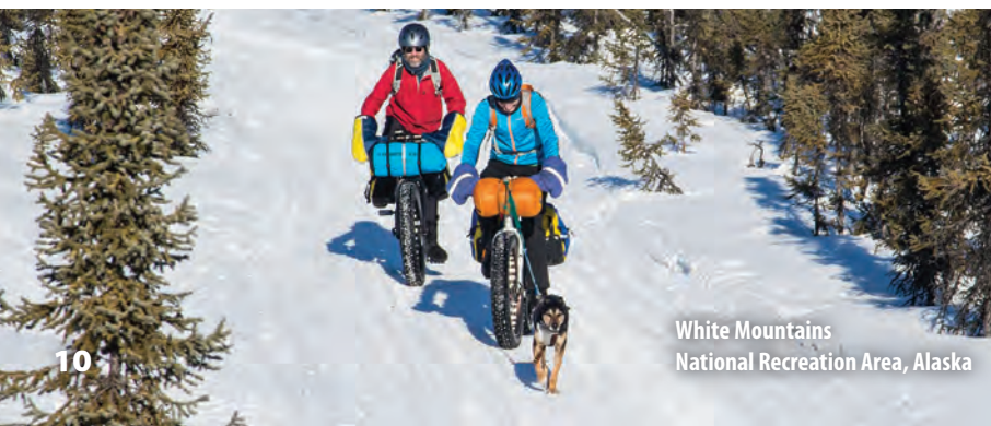
White Mountains National Recreation Area, Alaska

Oregon National Historic Trail During much of the 19th century, an estimated 300,000 emigrants used the Oregon Trail as a pathway toward the Pacific. Fur traders, gold seekers, farmers, missionaries, and others traveled west on the approximately 2,000 miles of trail, which begins in Missouri, goes toward the Rocky Mountains, and ends in Oregon's Willamette Valley. Traces of pioneers, such as wagon ruts, are still visible on the trail today. Visitors can now make the once 5-month journey by automobile along highways that closely parallel the historic route. Portions of the trail are accessible by foot, mountain bike, and horseback. The trail goes through six states, including Missouri, Kansas, Nebraska, Wyoming, Idaho, and Oregon.